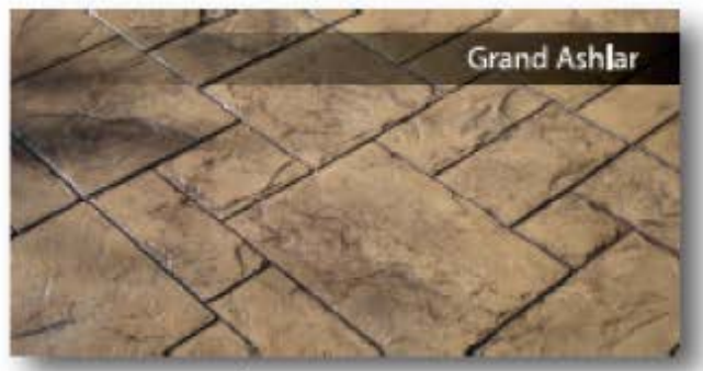
Color Hardener: Mojove Release Color: Mochd