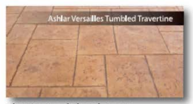
Color Hardener: Espresso | Rejease Color: Terra Cotta