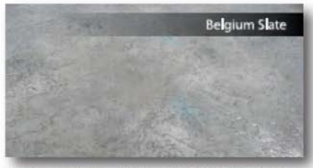
Color Hardemer: Oceanside & Soft Gray | Release Color: Midnight Gray