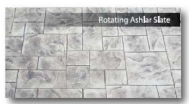
Color Hardener: Sand Canyon | Release Color: Mocha