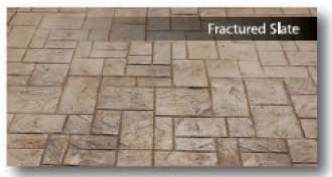
Color Handemen: Cream Buff | Release Color: El Peso