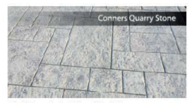
Color Hardener: Navajo | Release Color: Soft Gray