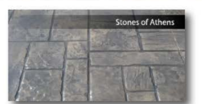
Color Hardemen: Walnut & El Paso | Release Color: Midnight Gray