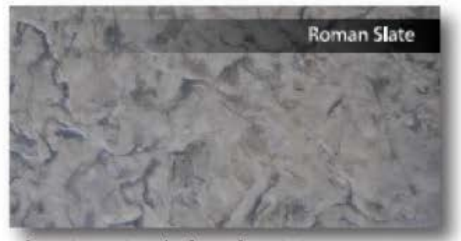
Color Hardener: Soft Gray | Rejease Color: Midnight Gray