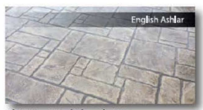
Color Hardener: Mojour | Release Color: Walnut