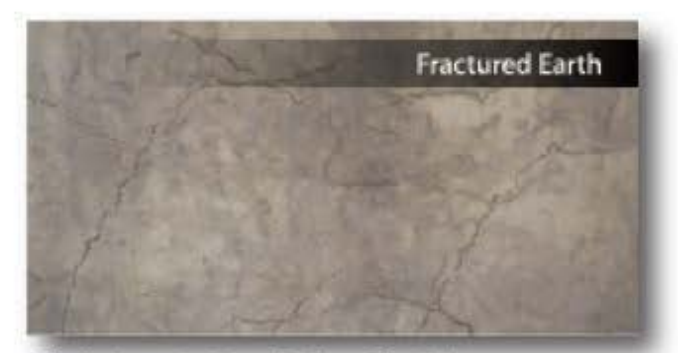
Color Hardener: Sand Canyon | Release Color: Weinut