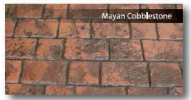
Color Hardemer: Georgia Clay | Release Color: Midnight Gray