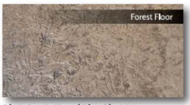
Color Hardener: Sand Canyon | Release Color: Walnut