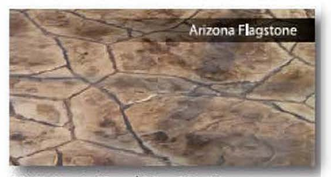
Color Hardanan Sand Count | Ralaasa Color-Webut