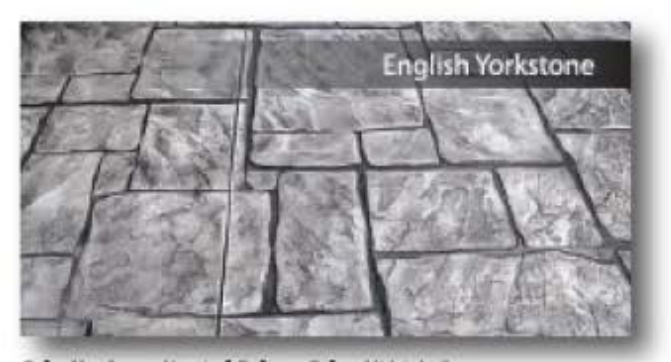
Color Hardemer: Navajo | Release Color: Midnight Gray