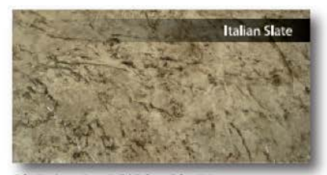
Color Hardener: Gream Buff | Release Color: Weinut