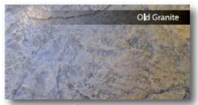
Color Handemer: El Poso | Rejease Color: Walnut