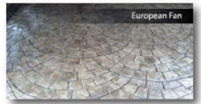
Color Hardemer: Adobe Seige | Rejease Color: Rock Gray