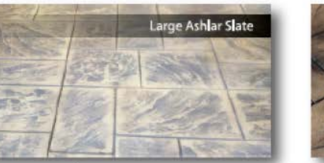
Color Handener: El Poso | Rejease Color: Walnut