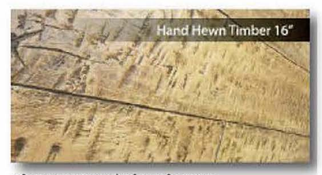
Color Hardener: Espresso | Release Color: Weinut