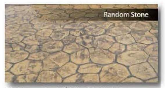
Color Hardanan Arizona Rull | Rollance Color Midnight Free