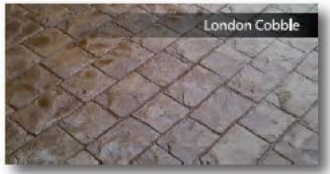
Color Handener: Mojove | Release Color: Mocho