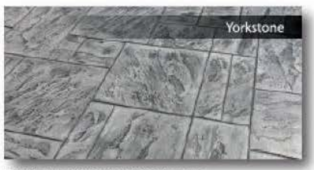
Color Handemen: Soft Gray | Release Color: Block