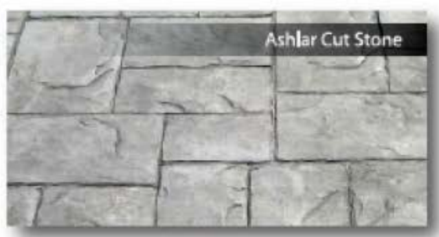
Color Hardemer: Oceanside | Rejease Color: Soft Gray