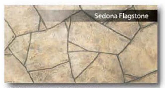
Color Hardener: Espresso | EZ-Tique: Walnut