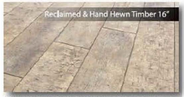
Color Hardener: Send Cension | Release Color: Walnut | EZ-Tique: Michight Gray

Color Handener: Artrone Buff & Spinsh of Terre Cotte and Sudde Seen | Release Color: Weine