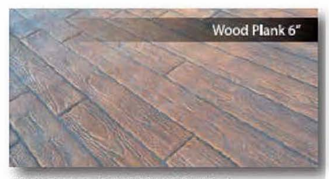
Color Hardener: Terrs Cotto | Release Color: Weinut