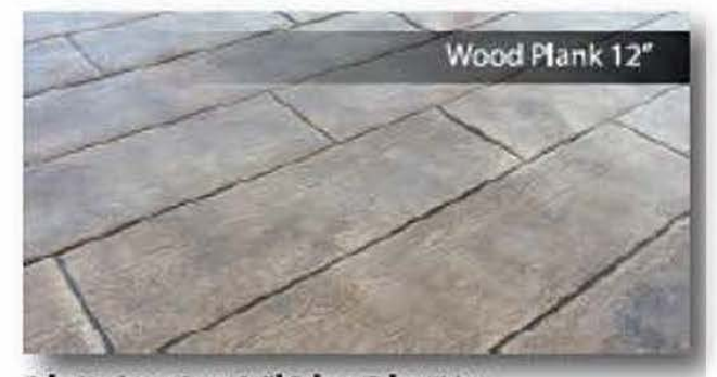
Color Hardener: Cream Buff | Release Color: Weinut