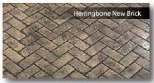
Color Hardener: Arizona Buff | Rejease Color: Midnight Gray