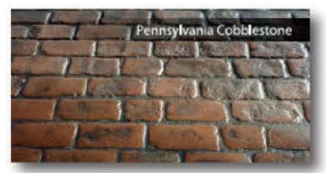
Color Handemen: Terre Cotte | Release Color: Midnight Gray